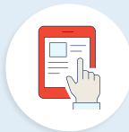
POST OFFER EMPLOYMENT TESTING