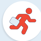
RETURN TO WORK