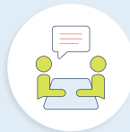
SAFETY CONSULTATION SERVICES