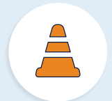
WORKPLACE SAFETY TRAINING