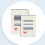
IN-HOUSE CLAIMS SERVICES