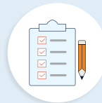
NURSE TRIAGE & NURSE CASE MANAGEMENT