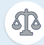
COMPREHENSIVE IN-HOUSE LEGAL SERVICES

*Only available with an MEM policy at this time.